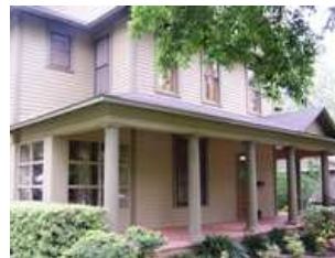
Beautiful older homes like new with ECO IMPROVE™ Energy Saving Rehabbing

joined forces with what we believe IS the best in green building materials in creating our truly green building system and more importantly our ECO IMPROVE